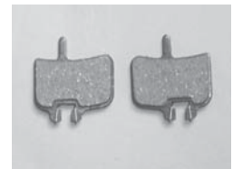
Full Hydraulic and MX-1 Brake Pads