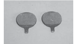
MX-2 Brake Pads